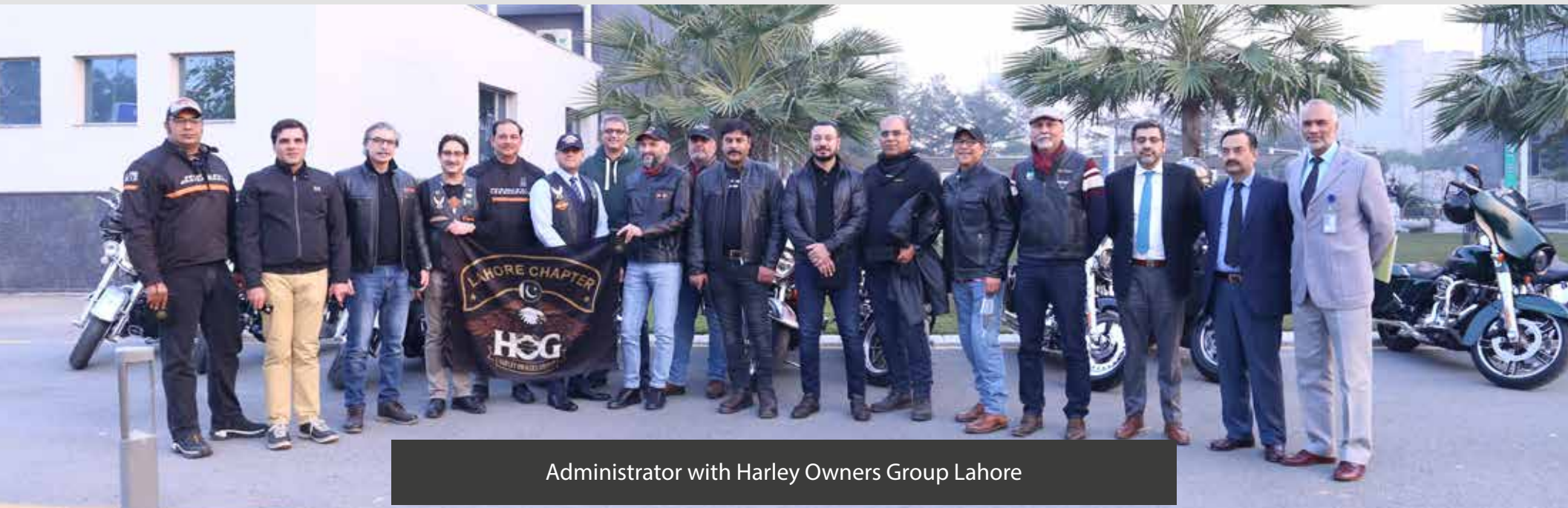
Administrators with Harley Owners Group Lahore